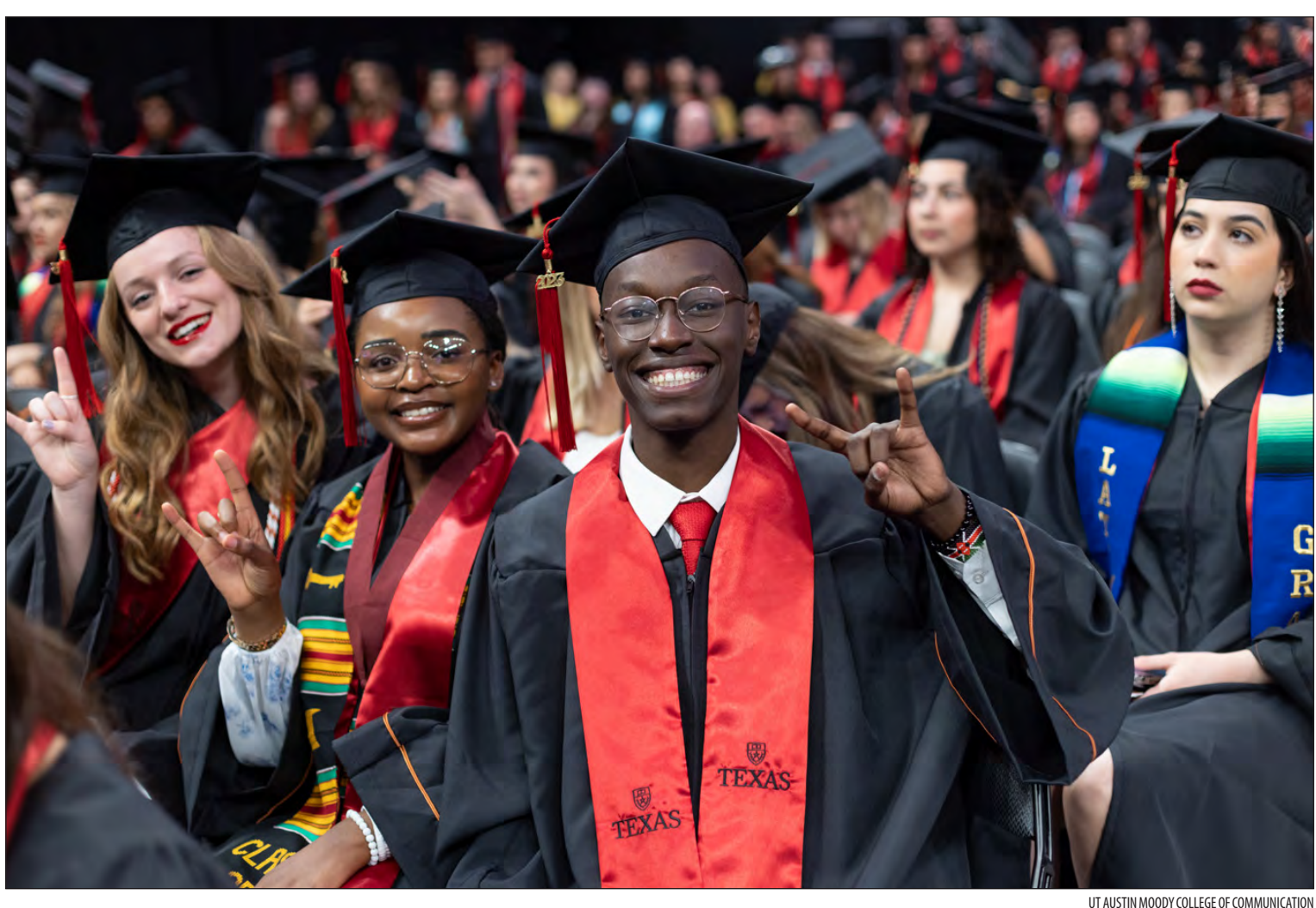
University of Texas College of Communication graduates celebrate 2023 spring commencement.