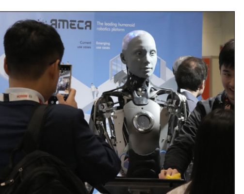
Ameca, a robot created by English company Engineered Arts. can hold conversations in dozens of languages and execute drawing and creative writing requests.