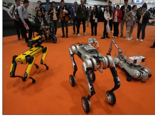
Robotic dogs and remote-controlled sentries on show for for visitors at the International Conference on Robotics and Automation in London.