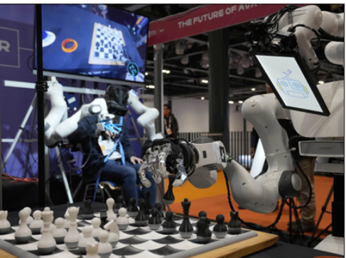
A prize-winning robot created by German university students plays chess, remotely directed by an operator who sees the board through a virtual reality headset.