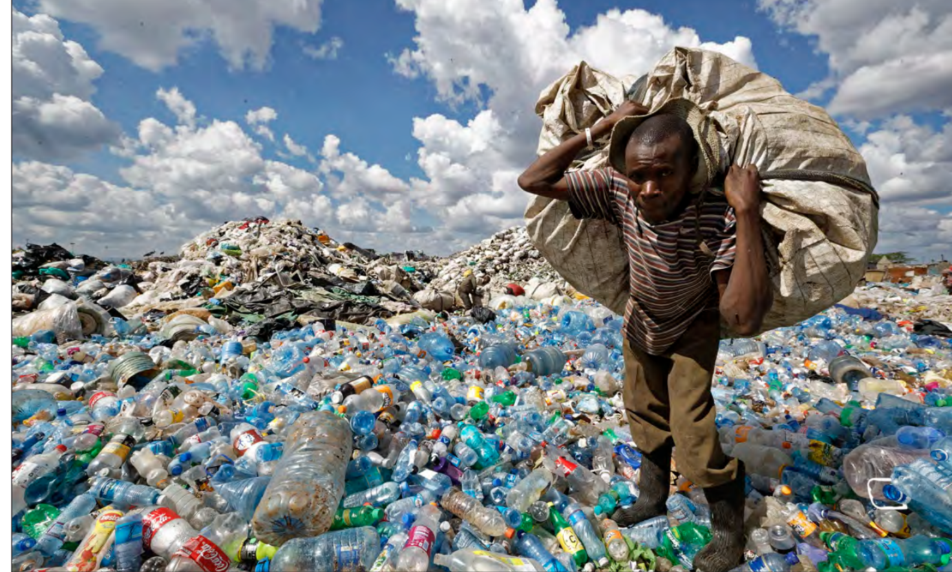
A man walks on a mountain of plastic bottles as he carries a sack of them to be sold for recycling in Nairobi, Kenya on Dec. 5, 2018. Negotiators from around the world gather at UNESCO in Paris on Monday for a second round of talks aiming toward a global treaty on fighting plastic pollution in 2024.