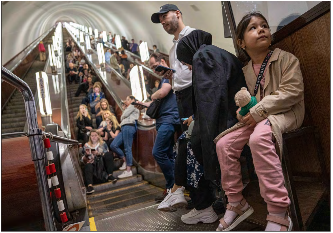
People take cover at a metro station during a Russian rocket attack in Kyiv, Ukraine, on Monday. Explosions rattled Kyiv during daylight as Russian ballistic missiles fell on the Ukrainian capital, hours after a more common nighttime attack by drones and cruise missiles.